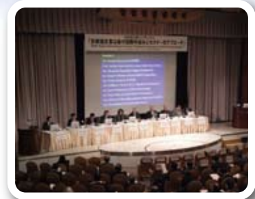
EU, US and Japan Trilateral Symposium

GISPRI will continue with our research and survey work for effective measures to combat global warming such as through our study on the sectoral approach advocated by the Government of Japan as a key component of the post-2012 international regime after the first commitment period of the Kyoto Protocol expires.