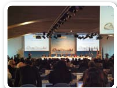
The 27th Session of the Intergovernmental Panel on Climate Change (IPCC)

As an observer, GISPRI has participated in meetings including the sessions of the Intergovernmental Panel on Climate Change (IPCC) and the Conference of the Parties (COP) to the United Nations Framework Convention on Climate Change. We have also provided active support