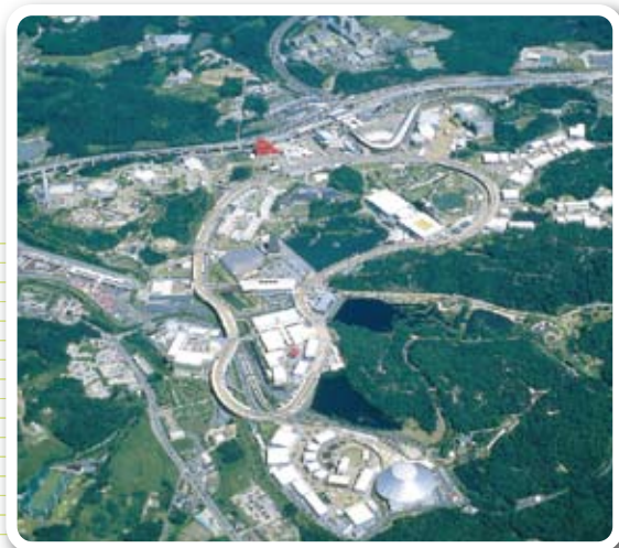
Venue of Nagakute, EXPO 2005

The projects consist of the following three types: "EXPO 2005 commemorative projects," "projects to convey the achievements of EXPO 2005" and "EXPO 2005 practical application projects."