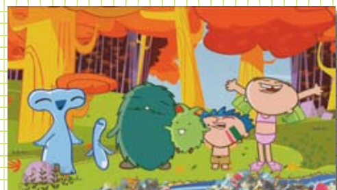
Animated Cartoon Co-Starring Morizo & Kiccoro with Fluvi and His Friends