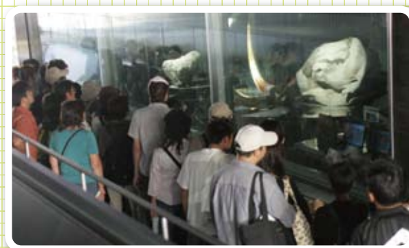
Frozen Remains of the Yukagir Mammoth, EXPO 2005