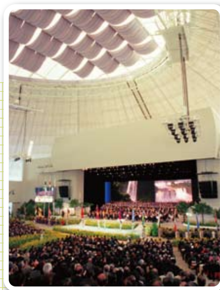
Opening Ceremony of EXPO 2005, Aichi, Japan (March 25–, 2005)