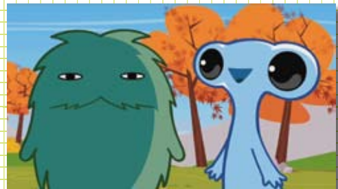
Animated Cartoon Co-Starring Morizo and Fluvi