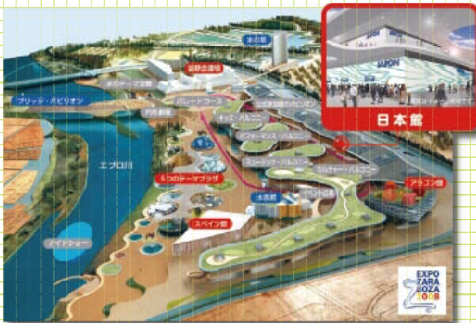
Venue of EXPO Zaragoza 2008